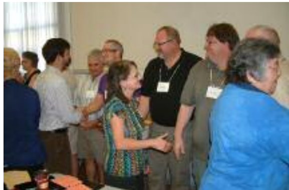
Greeting each other during opening prayer.