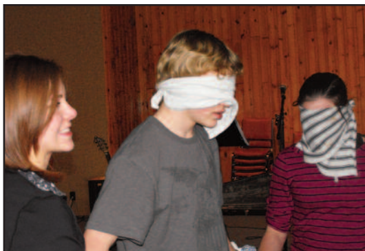
The tradition of urban vs. rural games continued at the annual event.