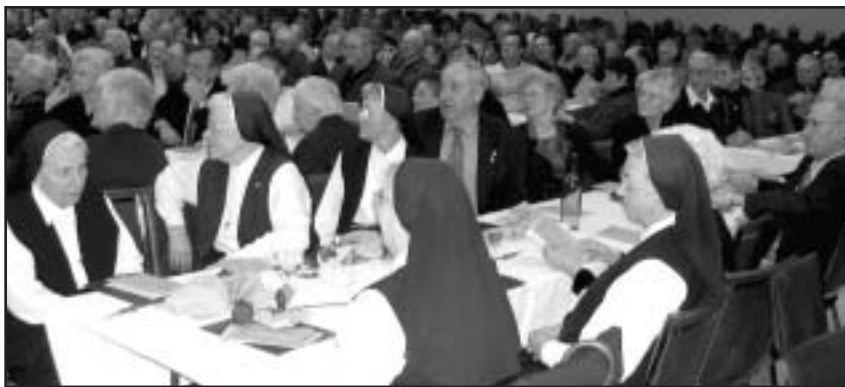
About 400 attended the event honouring clergy and religious.