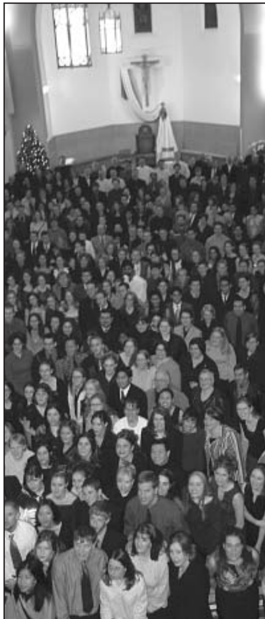
Hundreds of CCO conference delegates gathered at St. Paul’s Cathedral to celebrate the Eucharist on New Year’s Eve.