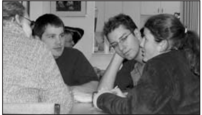
Youth representatives gathered Jan. 8 in Saskatoon in preparation for a Diocesan Vocation Congress.

The idea of a “preferential option for the young” which