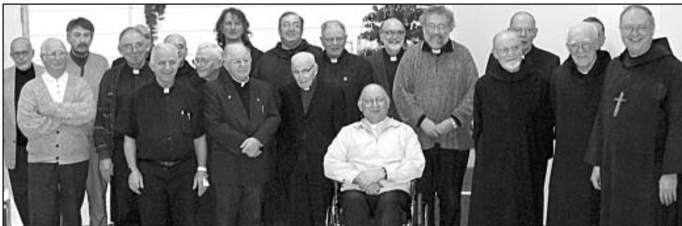
The Benedictine community of St. Peter's Abbey celebrated 100 years of history in the area in 2003.