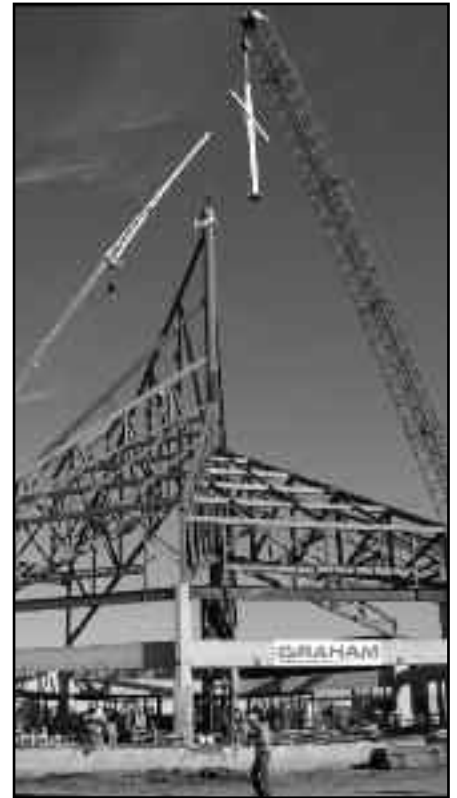
A large crane lifted the cross into place, and then workers lifted by a second, smaller crane secured it to the structure August 26, 2010.

Estimated completion date for the $28.5-million project is Advent 2011.