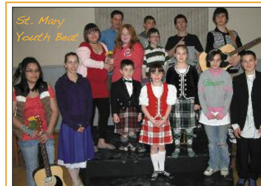
Youth at St. Mary's parish in Saskatoon held a Youth Beat coffee house in April, to share their gifts and talents. Proceeds from the event went to the diocesan Uniting in Faith campaign.