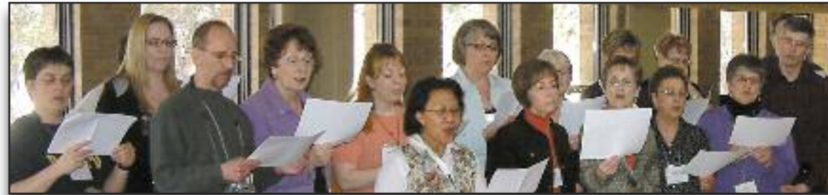
Participants in the diocesan Lay Formation program prepare for a celebration of the Eucharist. Lay Formation is a two-year program, in which ordinary Catholics grow in their relationship with God and in understanding of their faith. For more information contact the Catholic Pastoral Centre.