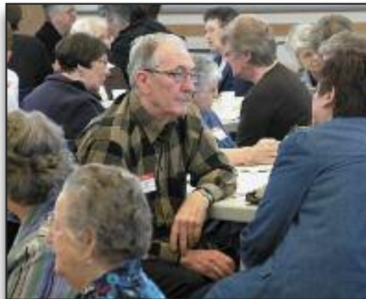
A Pastoral Care workshop was recently organized through the Catholic Pastoral Centre. The diocesan offices of Hospital Chaplaincy and of Ministry Development coordinated the training session held in March.