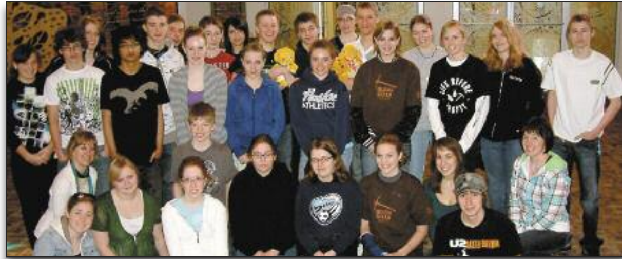
Youth from Wilkie, Langham, and Saskatoon participated in a diocesan Thinkfast March 27 and 28, fasting to raise funds for Development and Peace, while raising awareness through presentations and activities hosted at St. Anne Parish in Saskatoon.

Uniting in Faith parish campaign progress to date