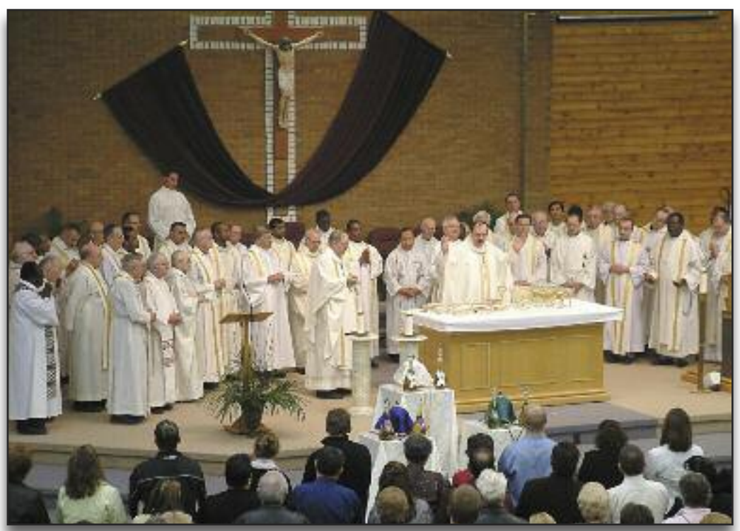
Diocesan Chrism Mass Priests and parish representatives from across the diocese gathered at the start of Holy Week for the diocesan celebration of the Chrism Mass, in which the bishop blesses the sacred oils that are then taken back to parishes for celebration of the sacraments over the next year.

For more information about the history of the project, the reasons for undertaking it at this time, and the vision for the Uniting in Faith campaign, please visit the website: www.unitinginfaith.ca